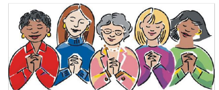
Pray for the Women's Retreat

If you have never taken on this responsibility, pray about it. There are many women in the church to support you and lend you a hand. You are not alone in this adventure.